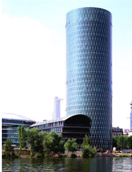
Westhafentower in Frankfurt am Main

This 31-storey office building in Frankfurt am Main has been equipped with BI-Radar.